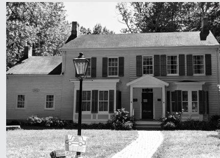
Thanks to the funds raised from last year's Spring mailing, the Deacon Andrew Hetfield House has been newly painted