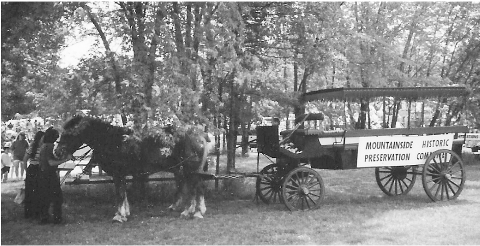
The Mountainside Historic Preservation Committee float participating in the Mountainside Centennial Parade in 1995